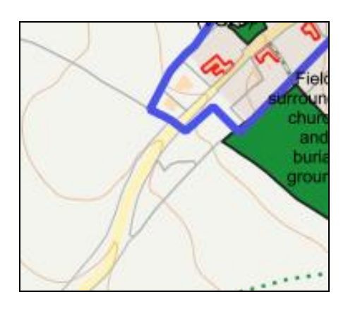
Image 2: Settlement boundary map extract shown on the NP proposed modifications. Note that the dwelling known as Stable View is not shown