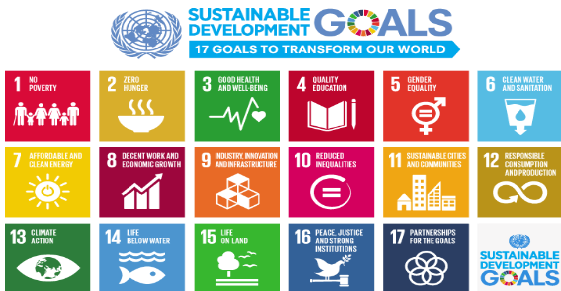
Figure 1: UN Sustainable Development Goals