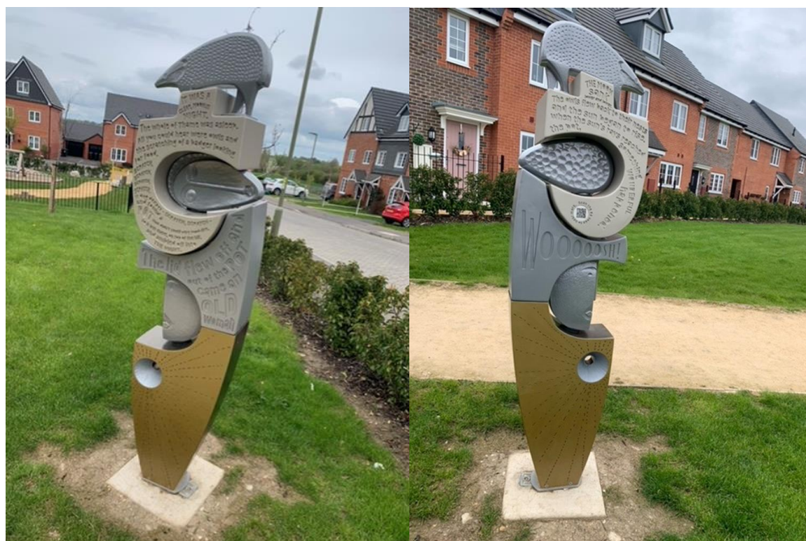
Thame Town Council – Part of wayfinding artwork funded by £80,250 of S106 contributions.

Town and parish councils that have received CIL funding must report what they have spent the money on to the council on an annual basis. The town and parish council expenditure reports are on our website .