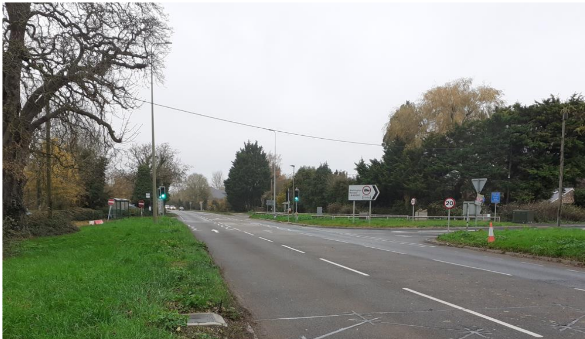
Toucan Crossing at Benson completed in 2022/23 by Oxfordshire County Council supported by CIL funding of £140,000 transferred to from South Oxfordshire District Council.