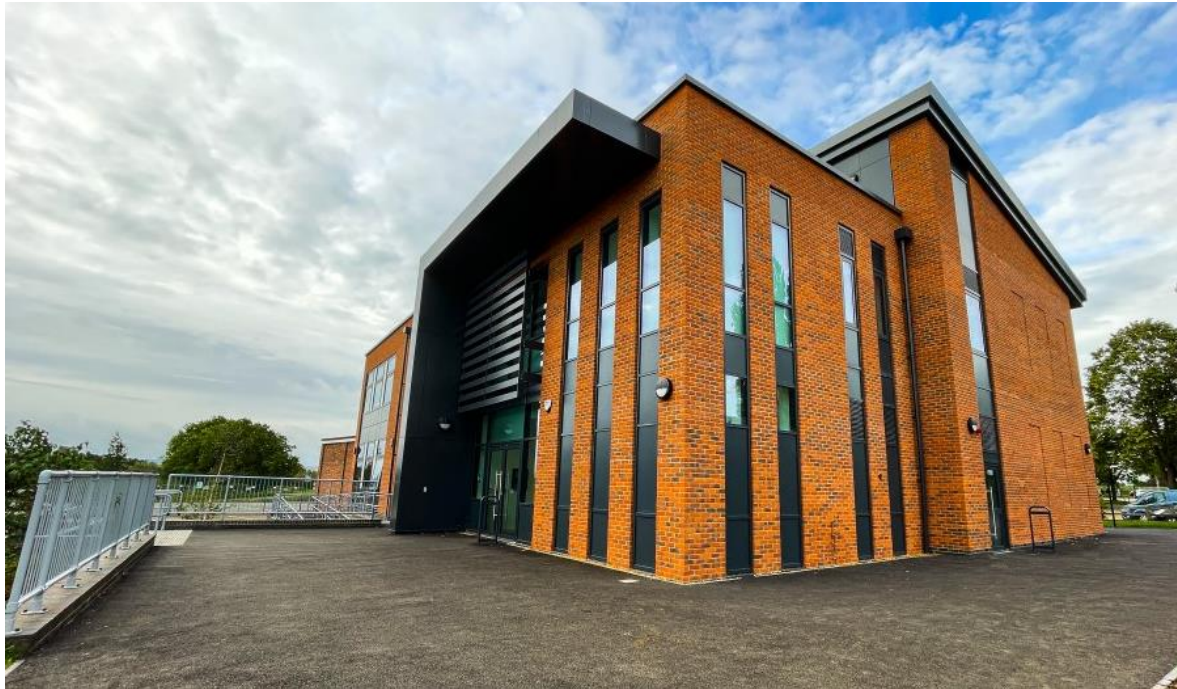
Expansion of Lord Williams School, Thame. Delivered by Oxfordshire County Council supported by CIL funding of £1,415,000 transferred to from South Oxfordshire District Council in 2022/23.

associated ancillary accommodation. The project was completed and ready for use in September 2020.