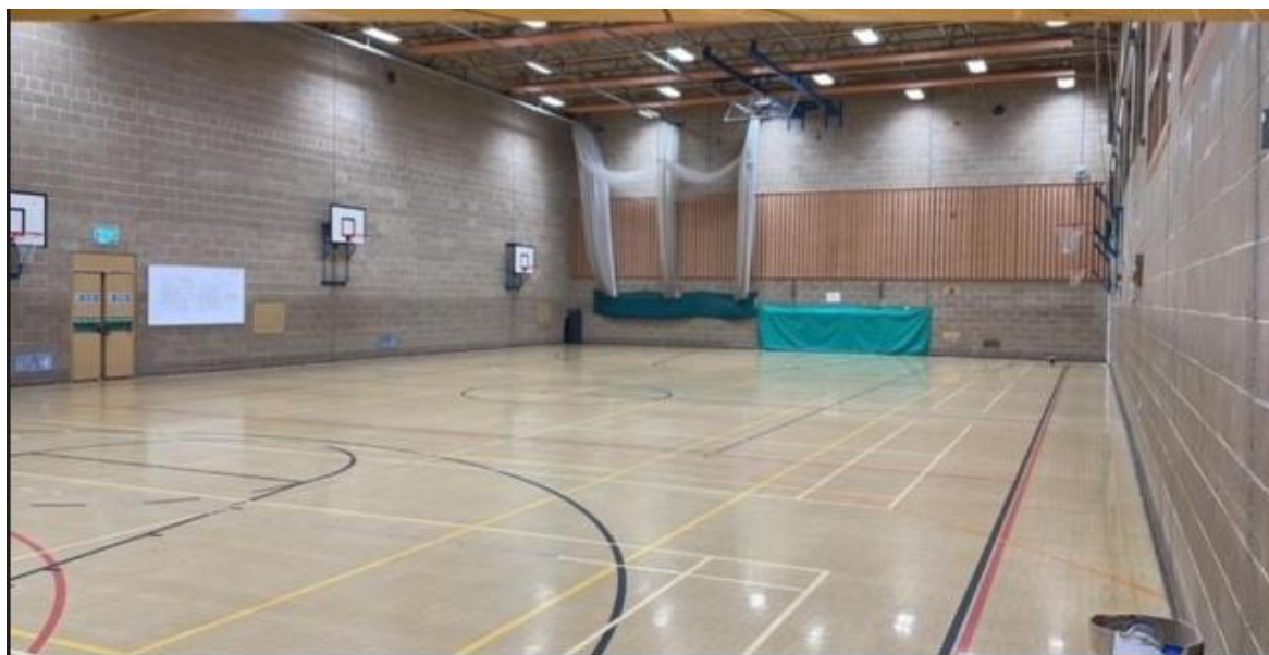
South Oxfordshire District Council – Didcot Leisure Centre sports hall lighting upgrade funded by £17,000 of S106 contributions.

Following the end of the reported year, £2,666,724 made up of CIL contributions collected between October 2021 and September 2022, have been released to OCC for essential education, highways and library improvements across the district. An additional £6,485,821 was transferred to OCC during the reported year for the same purposes.