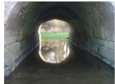
Figure 2.1 Wheatley Bridge, the remaining pointed arch of the medieval bridge can still be seen inside the reconstruction of 1809

The Thame river has been a moat and its bridge a barricade, at least twice. In 1642, Wheatley medieval bridge was provisionally agreed as a boundary point between the King in his Oxford capital and Parliament in London. One arch was cut, replaced by a drawbridge and the area heavily patrolled. The guard quartered on Wheatley. In 1940, during the Invasion Alert, the Bridge, part of the London-Birmingham road, was again guarded and blocked.