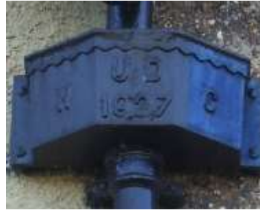
Figure 2.3 Hopper used for WUDC houses

2.3 London Road rises from its 'Cut' to Park Hill, passing the King's Arms fork where Church Road commenced the medieval route to Oxford, later turnpiked in 1719, over Shotover Hill. Upper London Rd took on the turnpike in 1789 paving a way to Oxford through Shotover Valley, which is now the A40. On Park Hill, Holloway Road crosses from Holton down the steep northern side of Wheatley valley. It is Wheatley's only north-south road. Old London Road, London Road, Crown Road, High Street and Church Road, not to mention the A40 and the M40, run E-W, all with eyes ultimately on London thereby shaping the linear village. Holloway Road connected the two ancient parishes of Holton and Cuddesdon long before Wheatley became a parish. At the bottom of the Wheatley valley, just where Air Quality is measured, Holloway Road crosses the High Street to climb the south side of the valley via Station Road and Ladder Hill along the old coffin-road past Coombe Wood to Cuddesdon, the former mother parish.