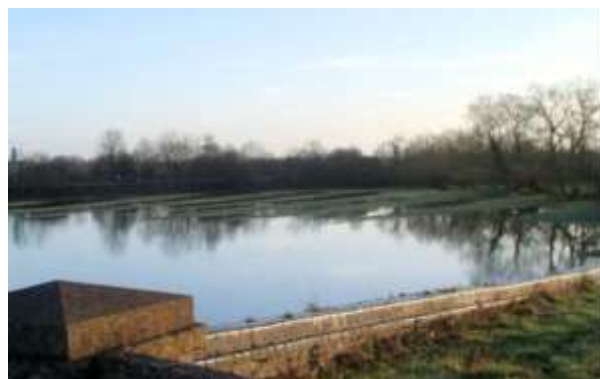
Figure 2.4 View of ridge and furrow from Wheatley Bridge looking south

2.5 There has been continuous habitation in the area since Roman times as overlapping Roman and Saxon estates with related burials attest. Stone and Iron Age settlements left their traces too. By the 10 th century, Wheatley had long been part of a royal Saxon estate centred on Cuddesdon. [5, 6, 7]. King Edwy gave it to the Abingdon Benedictine Abbey which remained the local landlord for almost 600 years. Cuddesdon parish and its Wheatley chapelry grew up in that period and a thousand years of ridge-and-furrow management still shows clearly in Wheatley's meadow land.