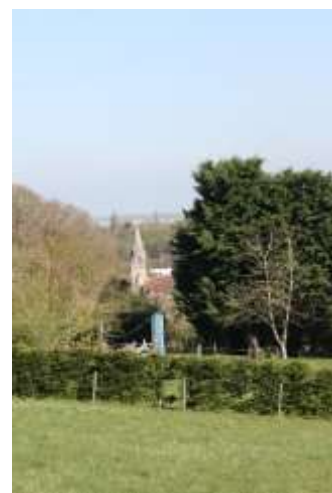
Figure 2.5 Wheatley in the Valley