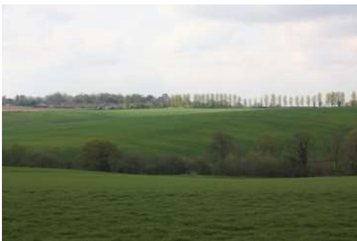
Figure 1.4 Cuddesdon on the Hill

2.8 Wheatley was never a market town. It became a parish only in 1856. Just one owner-resident family, the Archdales, lived at the Manor House (1568 – 1648), long before the Hassalls settled in 1939 for sixty years. Lord Camoys, one of the three generals at Agincourt (1415) and the House's best known owner, recruited here, but never resided. The Archdales embellished it as their wider family grew wealthy in London and in the Ulster Plantation. After the Elizabethan religious settlement, the Archdales, the Bromes of Holton (and the Cursons of Waterperry) were noted for recusancy and for harbouring outlawed priests. St. Mary's church was completed in 1856, the spire being added twelve years afterwards, and with a new village designation of Wheatley Urban District (1894) Wheatley eventually grew out of its Cuddesdon shadow.