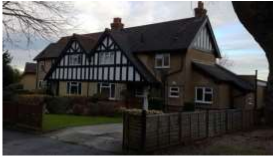
Figure 2.2 “Tudorbethan” style house in The Avenue