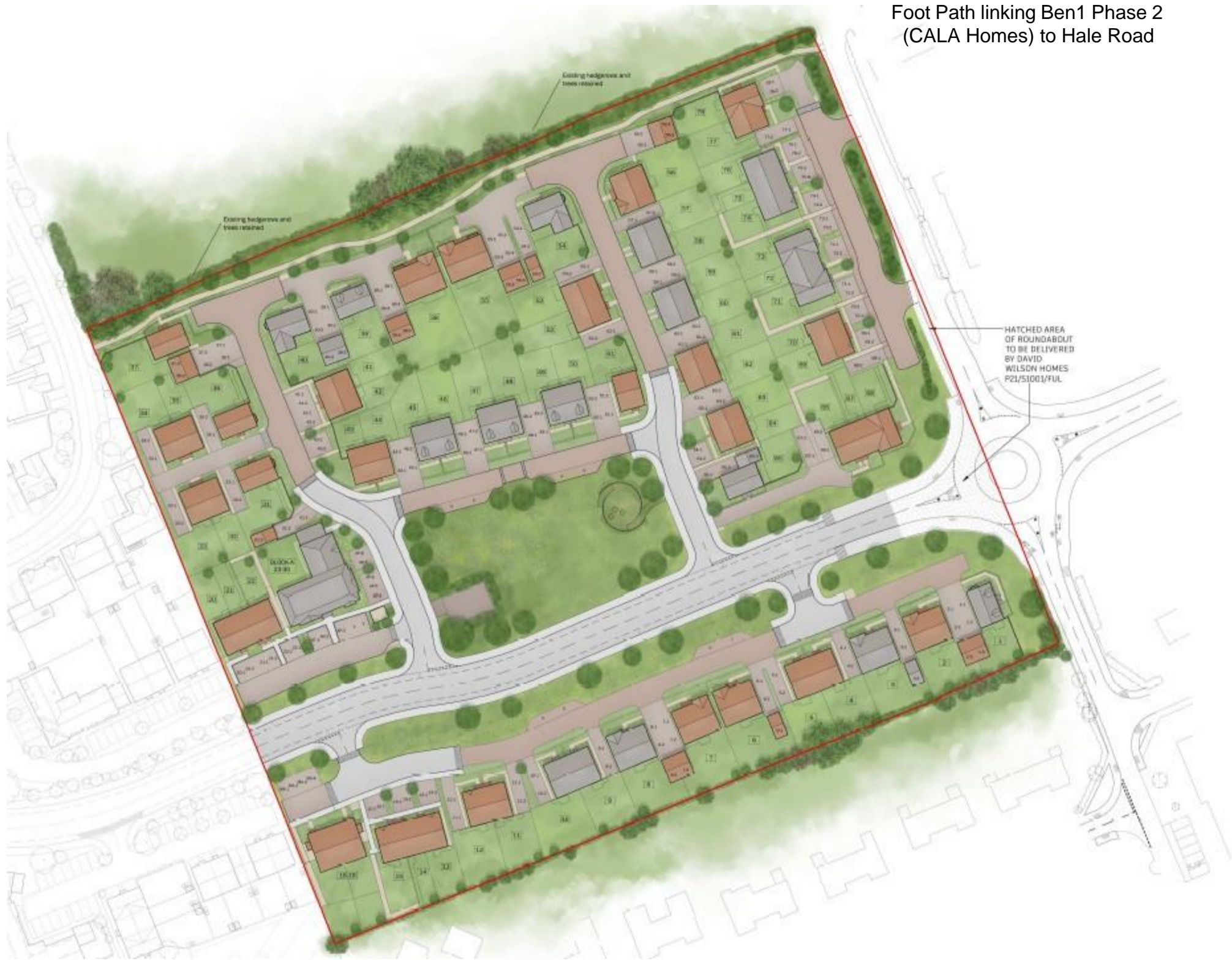
Figure H3 - BEN 2 - Thomas Homes Development showing Paths and Green Spaces.