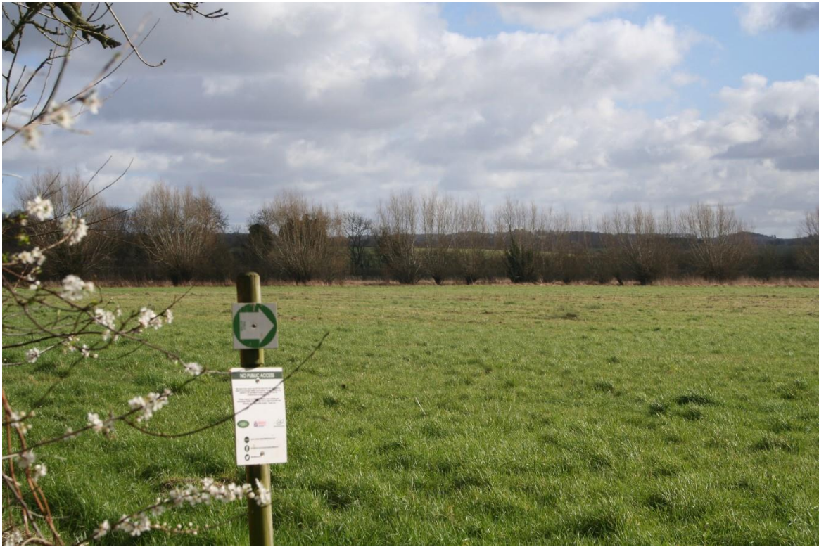
View 10a: The views from the A4074 from Shillingford, looking across the big field to Hale Farm (left), Benson (centre) and the airfield (right), with the backdrop of the Chiltern Hills (2017)