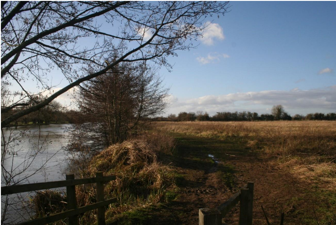
View 2: From the far side of the lock, looking across the River Thames towards Benson church tower, with the community space at Rivermead in the foreground (2017)