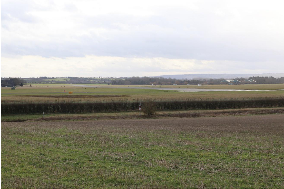
View 14: From Eyre's Lane, looking across Benson towards the North Wessex Downs AONB, and Wittenham Clumps. White houses to centre right are at Port Hill Road. (2017)