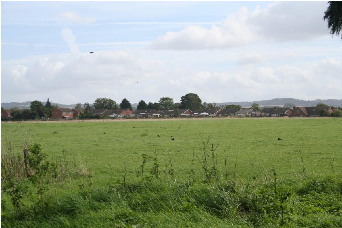
View 8: Views from Preston Crowmarsh towards the river meadows and the North Wessex Downs AONB across the river (2022)