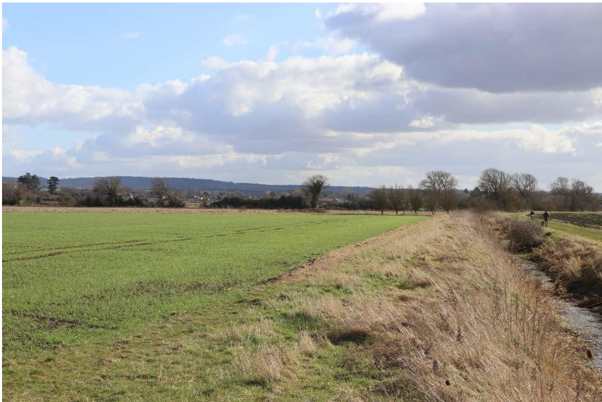
View 12: Views looking towards the North Wessex Downs AONBs as seen from the footpath to Rokemarsh (2017)