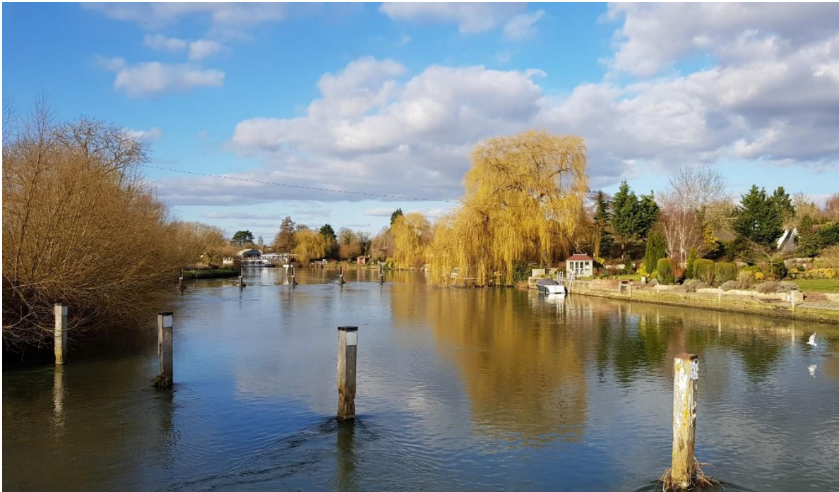
View 4a: Seasonal views from the Thames Path, looking across the River Thames towards the historic settlement at Preston Crowmarsh, e.g. towards Ferry Cottage (2017)