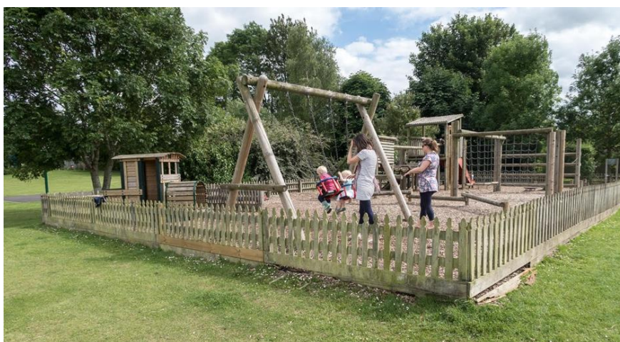
Children's playground at the Recreation Ground in Crowmarsh Gifford