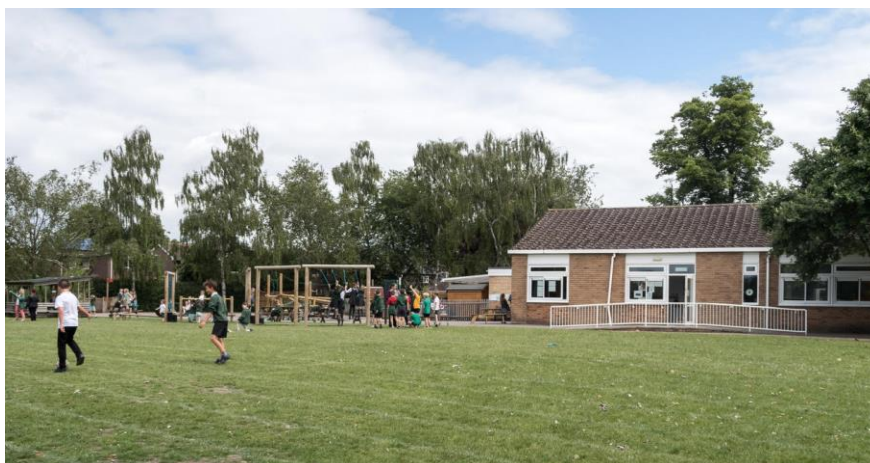
Crowmarsh Gifford Church of England Primary School