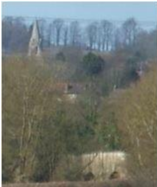
St. Mary's Church and Wheatley Bridge