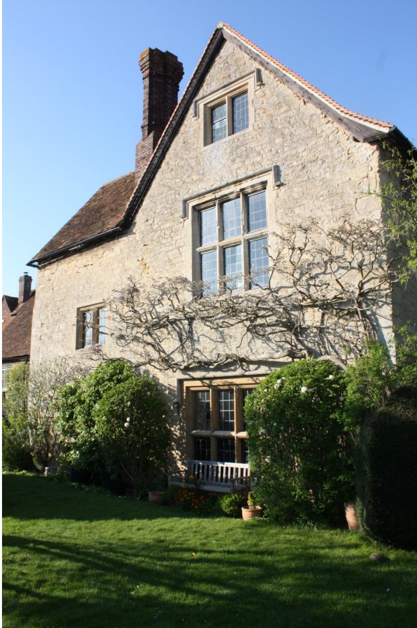
Figure 1.1 The Manor House from the south

development. Using the process described in Figure 1.2 the WNP Committee was able to evaluate the sites for potential development that would address the housing needs of the village and meets the village enhancement objectives of the neighbourhood plan. The whole process will now be described in greater detail in the following sections.