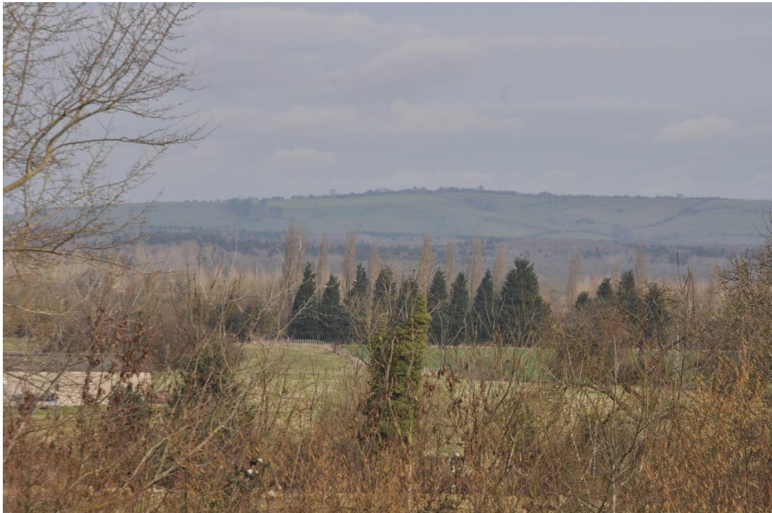
“Brill on the Hill” from OBU