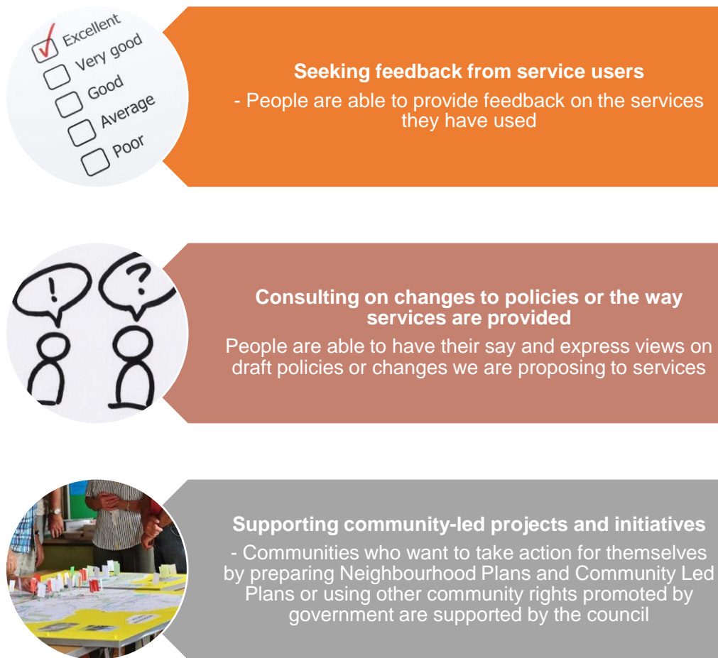
Figure 1: Types of public engagement activity supported by the council 5