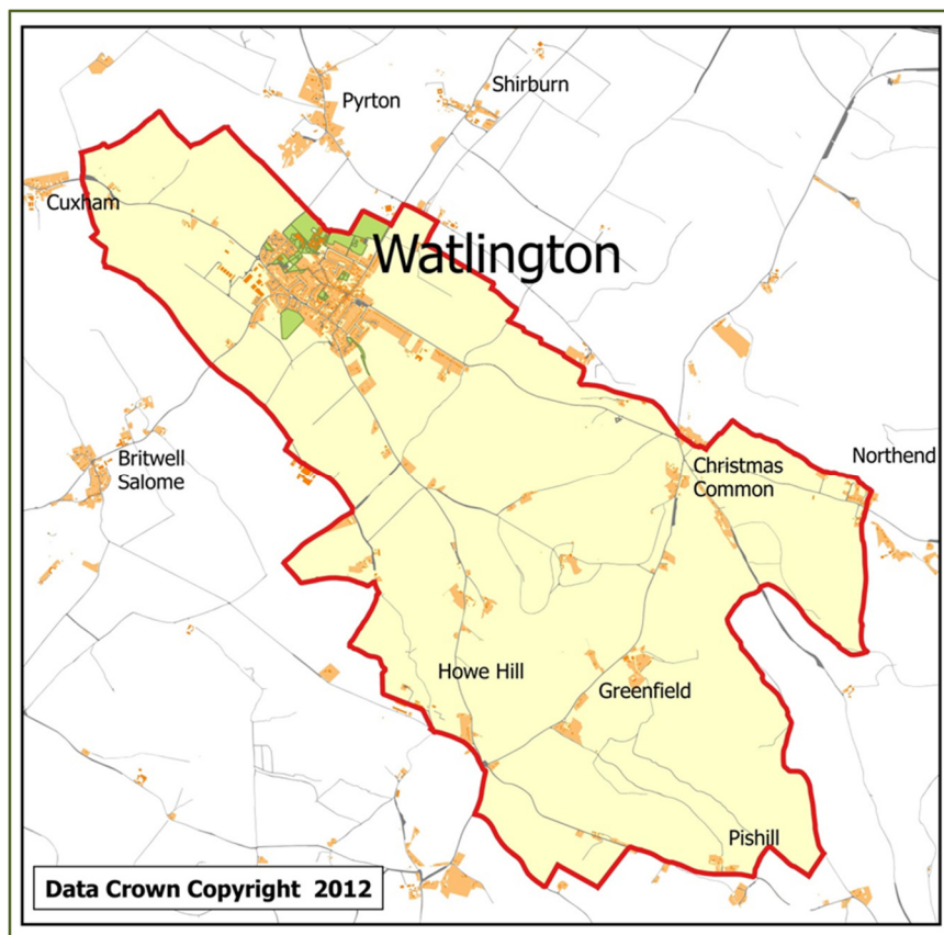
Figure 2 : Designated WNDP Area 2015

The WNDP designated area includes the settlement of Watlington itself, and the three outlying settlements of Christmas Common, Greenfield, Howe Hill, and parts of Northend and Pishill. The outlying settlements contain about 15% of the Neighbourhood Area population. Where relevant, policies in WNDP relate to these settlements.