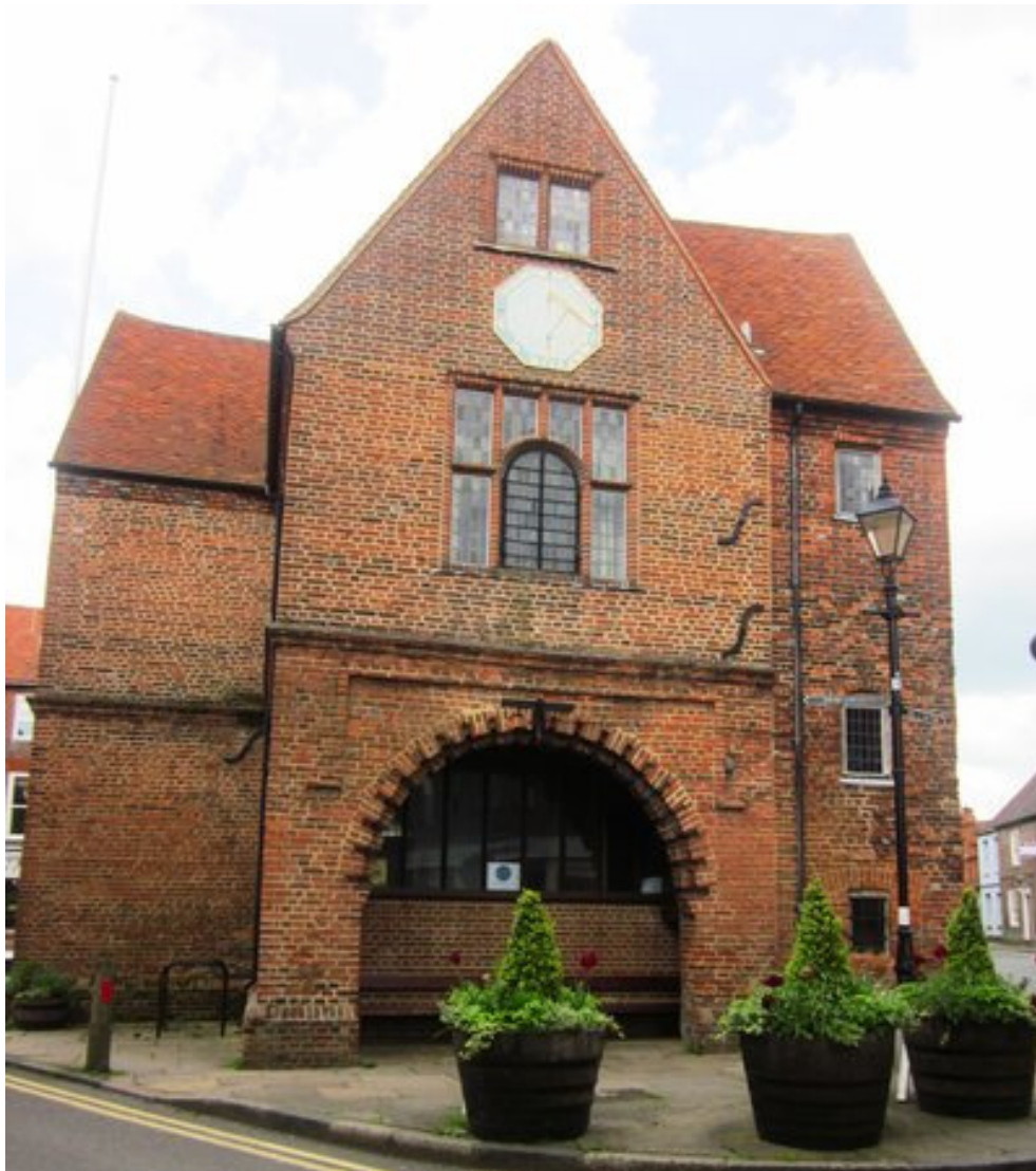
Watlington Town Hall