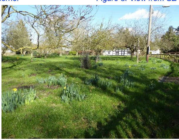
Figure 4. view from SW corner in spring