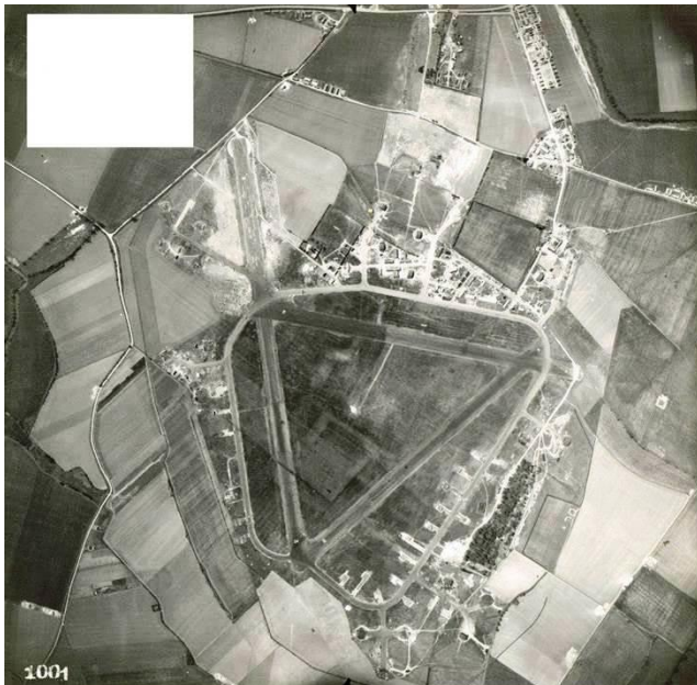
Aerial view of RAF Mount Farm, ca 1943-45