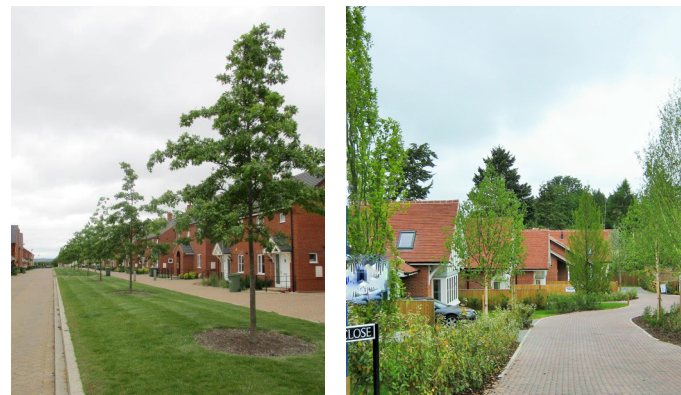
Feature trees to soften the built form (Great Western Park, Didcot and Goring-on-Thames)

A key tool to ensure the successful establishment of a planting scheme is aftercare and maintenance programmes, such as a Landscape Management Plan. Seeing your planting scheme as an asset that is worth caring for with simple measures will ensure it achieves its full potential, successful establishment and a return on your investment.