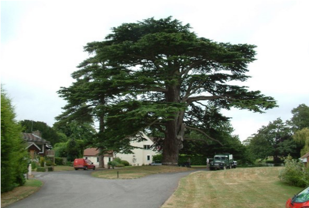
High value trees incorporated into open space as a key landscape feature for residents and visitors to enjoy (large Cedar, Aston Rowant, South Oxfordshire)