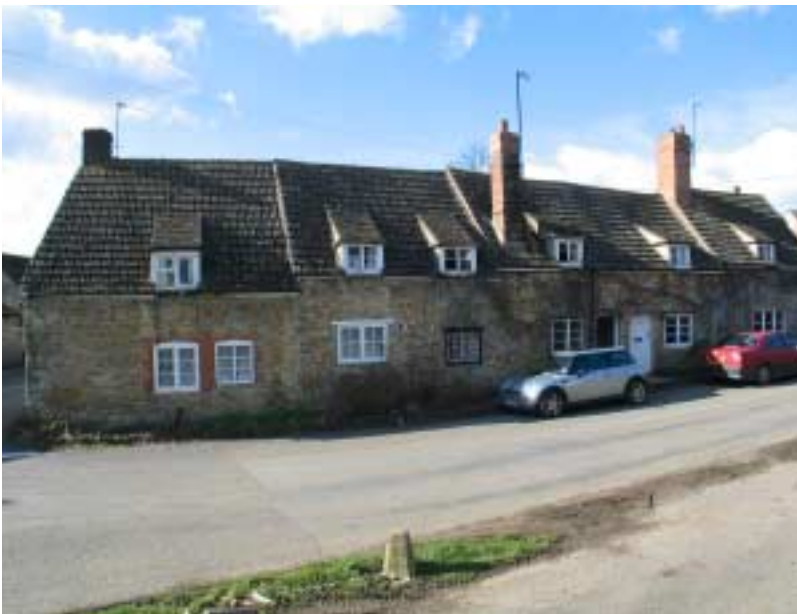
Fig.5 34-36 Thame Rd

houses within the village and as 'soft edges' to the village as a whole. There are a number of significant local views both inside and into the conservation area which form important parts of its character. The views in from Thame Road, Rectory Road and the fields behind the church and Church Farm reveal the essential character of the village. Similarly, vistas within the village (along Rectory Road or on Mill Lane, for example) are an attractive mixture of greenery, walls and buildings.