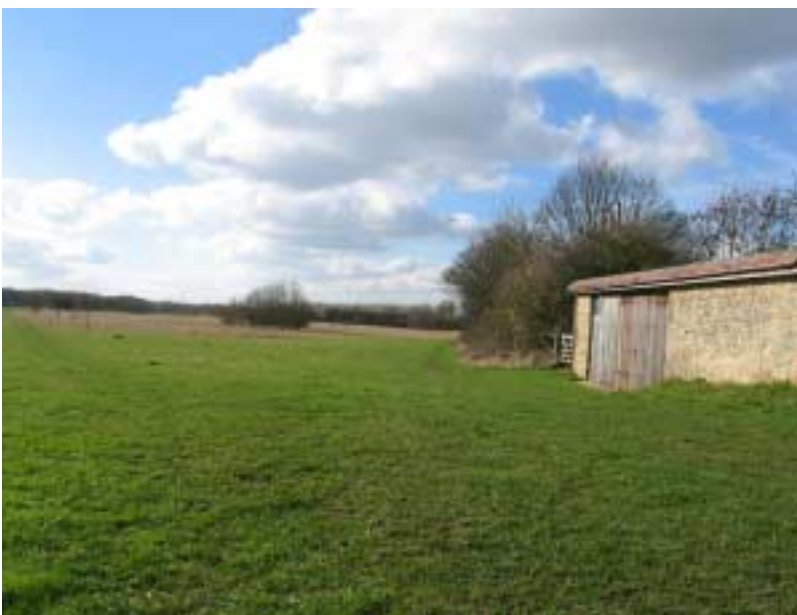
Fig.10 Field proposed for inclusion in the conservation area.

A much more extensive proposed addition to the conservation area is the large field behind and to the west of the war memorial, see fig.10, The medieval earthwork forming its boundary still exists and it probably