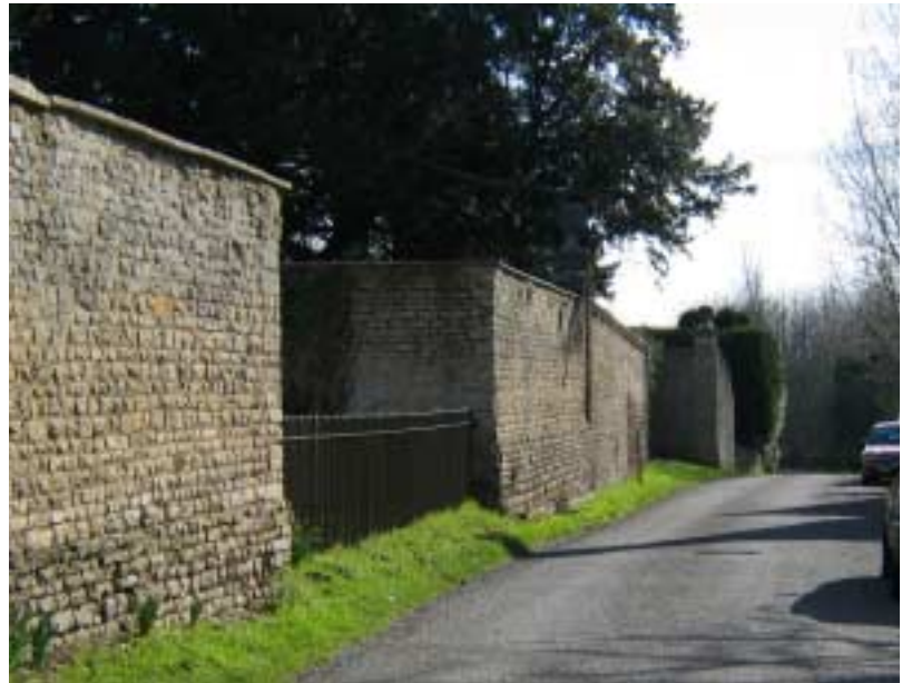
Fig.6 Manor House boundary wall

entrance to the Manor House. The stonework itself is also interestingly textured and patterned, the result of several phases of building whilst the visual impact of the wall is also softened by the large trees behind it and the grass bank in front.