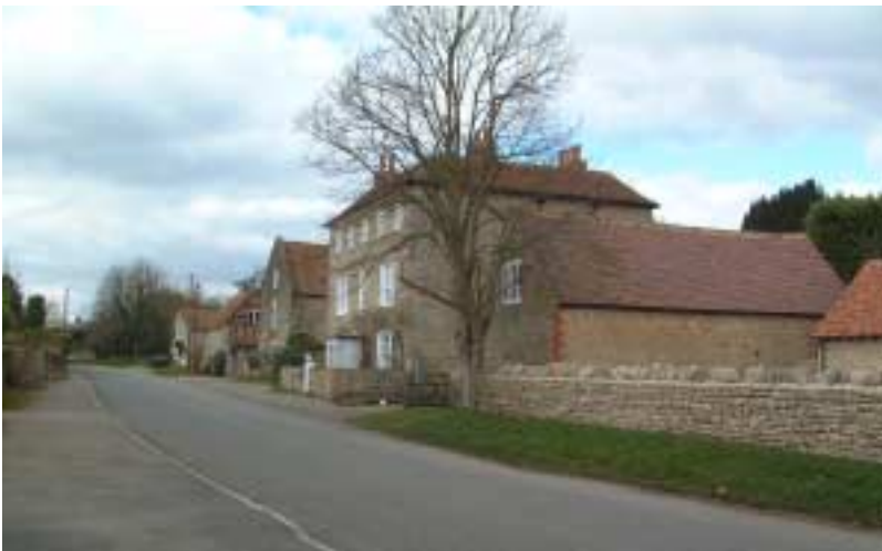
Fig 12 Rectory Rd looking west.

the street. Although of a similar date Hallowell is a smaller building with a less imposing, but no less attractive, façade. Also built in coursed rubblestone it has a similar stringcourse defining its two storeys and a delightfully textured old tile roof. Opposite Crucks is The Farm, a close-knit group of buildings abutting Church Farm House. The main house is an early 18th century building presenting its gable end to the road and its main elevation to a small yard with an attractive brick, stone and timber granary dated 1762 and a range of former stables opposite. The modern working part of The Farm is accessed from a track beside the rubblestone Stable Cottage with Rose Cottage flanking it.