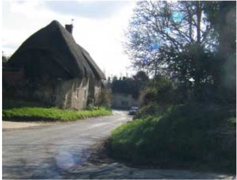
Fig.2 37 Thame Road

Trees contribute greatly to the character of the area. The area around St Peter's Church and the Manor House has many mature trees. These are an interesting mixture of native species in hedges and more exotic specimen trees in the grounds of the Manor. This area also enjoys important screens of hedgerow trees, especially on the western side of Thame Road and those that mark the boundary of the manor, both native and formal examples. Trees are also features of the open spaces within the village and play an important role on the traditional edges of the village, like Backway. The large open areas in the village are formed by the grounds of the large houses and church and by the open fields and large gardens of modern houses. All these make an important contribution both as settings for the