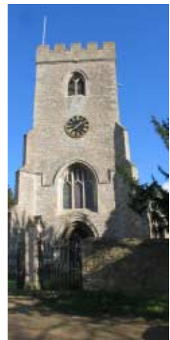
Fig.9 St Peter's Church

The path along the eastern edge of the churchyard also borders Church Farm