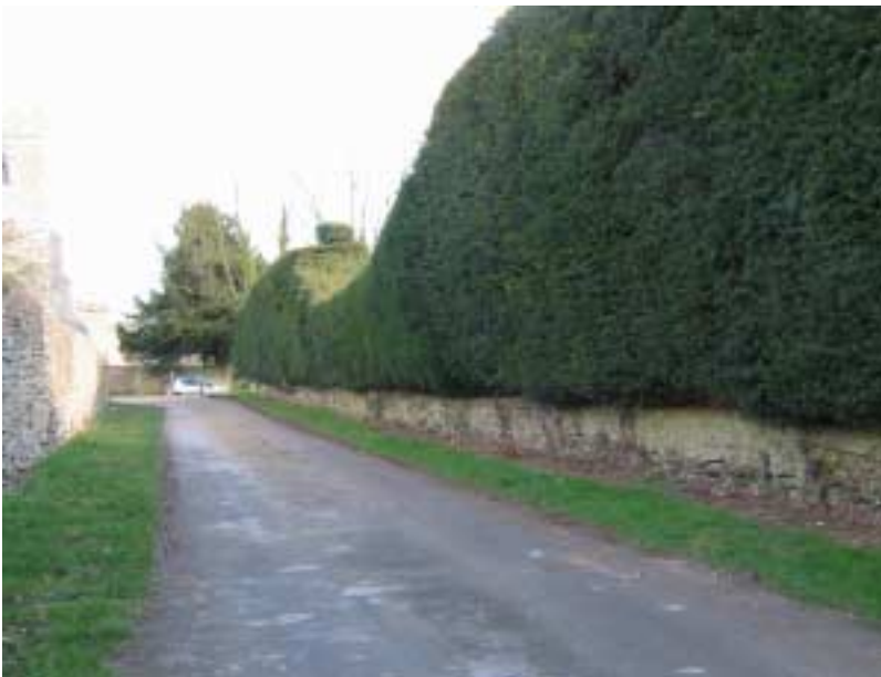
Fig.7 Yew hedge to the south of Manor House

The Manor House and church stand separate from rest of the village. The north and east sides of this complex (the land beyond Church Farm and the church yard) are open onto fields. These not only demarcate the Manor House and church area but also afford interesting views into the conservation area. The eastern side of the church and farmyard offer spectacular views of the distant Chilterns due to the sloping topography on that side.