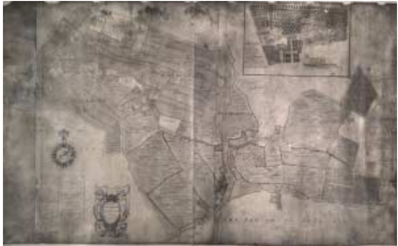
Map 1 Gascoyne's map of 1701

The name is thought to derive from Hazel Ley - meaning a clearing in a Hazel wood. For many centuries