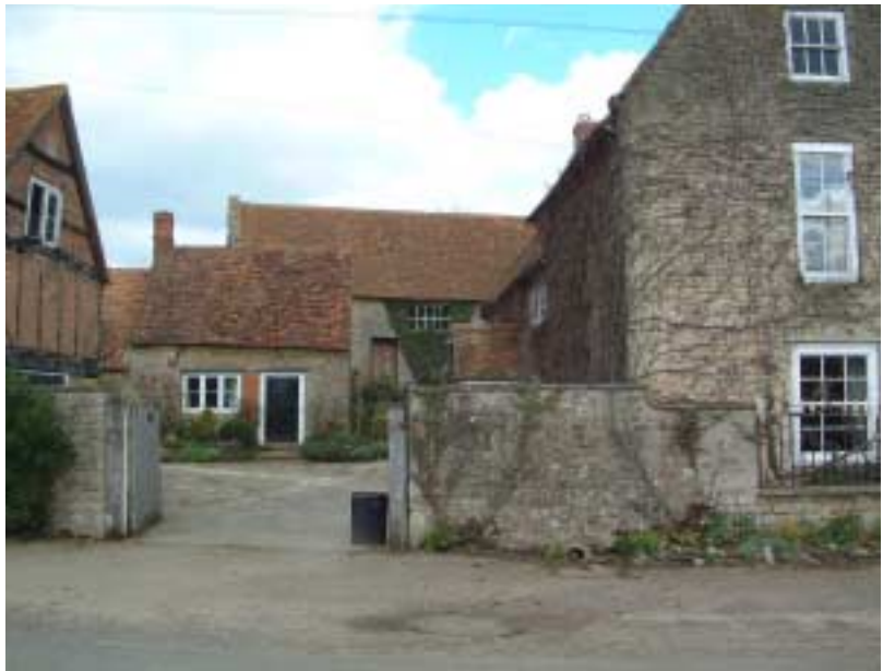
Fig.3 The Farm, Rectory Road