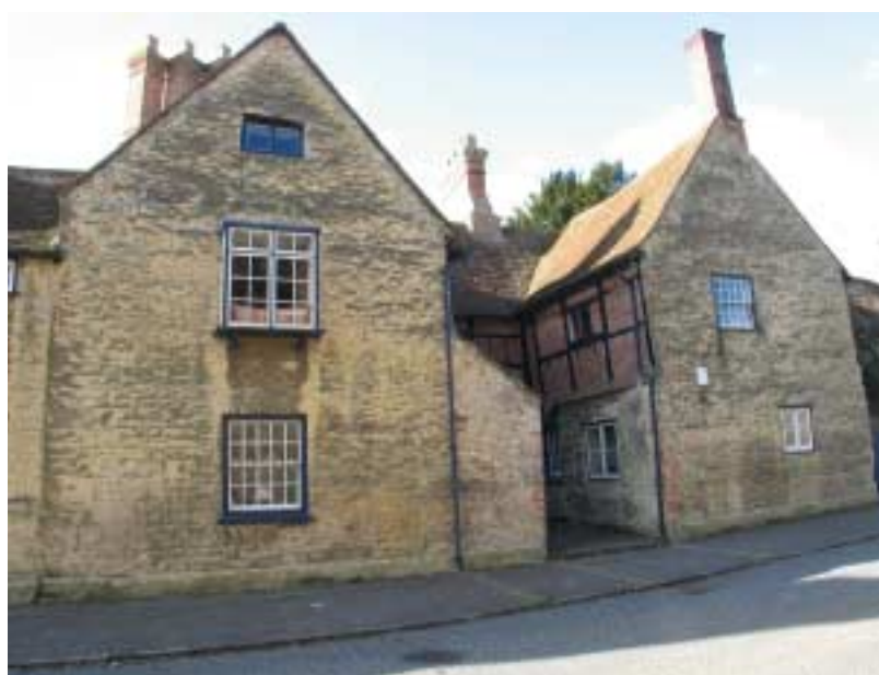
Fig.1 The Crown House

The topography and historic development of the village in these distinct areas has produced an interesting variety of historic characters that is the essence of the village today. The village features spaces bounded by walls and trees that give an enclosed feeling, open areas with a more public character and areas with a rural character. Despite this variation there is great consistency in building materials throughout the village, principally due to the widespread use of local stone in buildings of all dates and types.