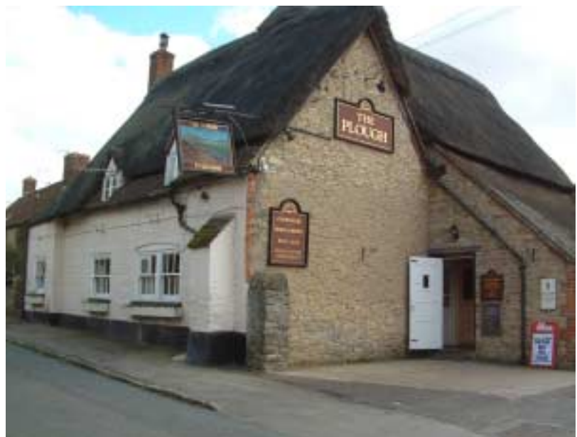
Fig.13 The Plough

less well-preserved although there are some fine individual buildings and the overall historic form is still strongly apparent. An area of modern infill between The Plough and No. 24 Rectory Road (the four modern houses; Yanwath, Eaves, Barton Turf and Hunter's Moon) breaks the established pattern of building both in form (the houses are too deep with shallow pitched roofs) and in materials. Horse Close Cottages make an even greater intrusion into the scene by opening out what would have been a winding section of lane flanked by hedges, although the original effect has softened since the houses were built in the 1950s. Fortunately, this does not affect the view downhill from The Orchard. This building, No. 24 and Vine Cottage form an attractive group with creeper-covered stonework and the thatched roof of Vine Cottage overshadowed by trees before the road winds out of sight. The view back into the village is similarly interesting with a rhythm of gables and the corniced front of Sundial House running down the hill to The Plough, with the stone wall to the left festooned with vegetation. The