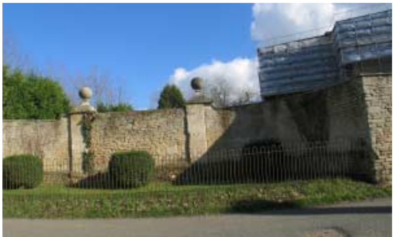
Fig.4 Gates piers to The Manor House