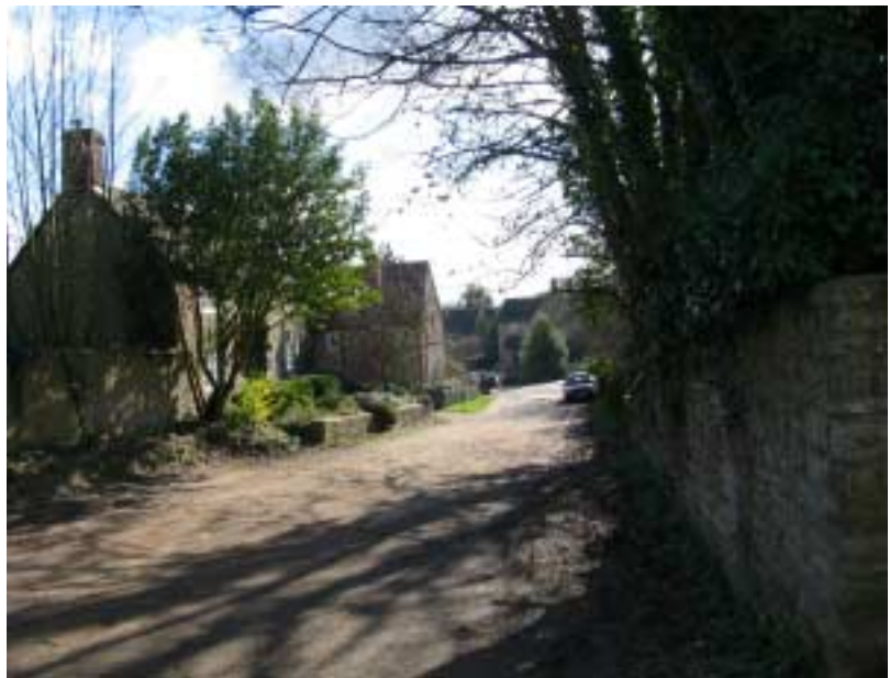
Fig.8 Church Hill

At the top of Church Hill stands St Peter's Church. The church tower is a dramatic feature, see fig.9. The wide iron gates to the churchyard, small trees and open setting of the tower emphasise its importance and stature and visually it balances the Manor House. An attractive path formed by