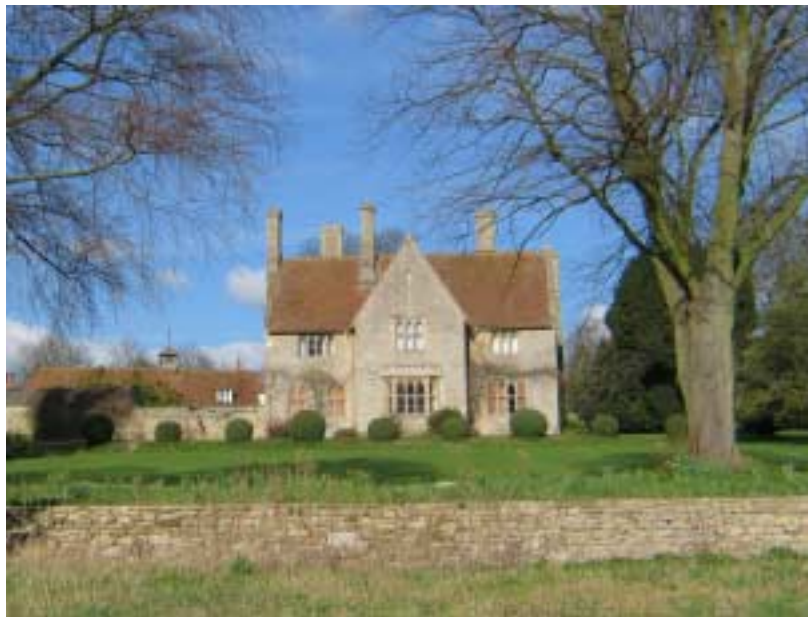
Fig.11 The Old Rectory

Rectory Road contains the bulk of historic buildings in the village. These are spread along its long and winding route which contains quite distinct changes in character. The eastern end of Rectory Road, from the junction with Thame Road to The Plough public house, is very much the centre of the modern village but even within this small area there are subtle variations in the pattern of building that change the character of the village. One characteristic is the mingling of houses with agricultural buildings and ancillary outbuildings and the juxtaposition of relatively dense groups of buildings with open areas. The resulting pattern of building is consequently varied and