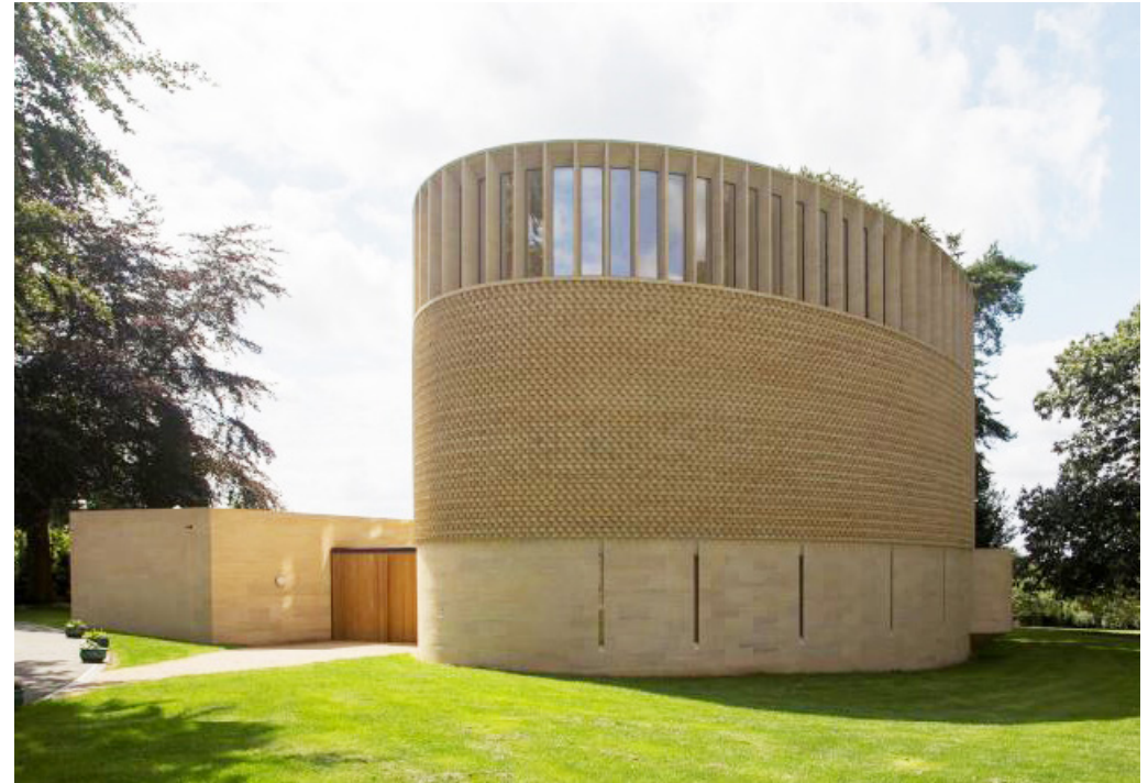
Cuddesdon Chapel, Cuddesdon

This guide will help establish the key design and planning principles of any new industrial, commercial or retail development to ensure that the buildings and spaces can be as effective and successful as possible and respectful of their setting.