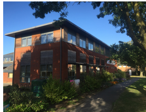
A range of non-domestic buildings (Milton Park and community centre in Didcot)