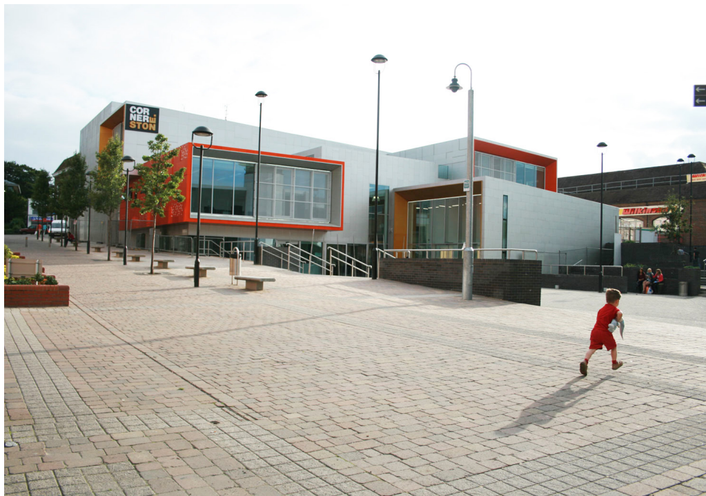
Cornerstone Arts Centre, Didcot