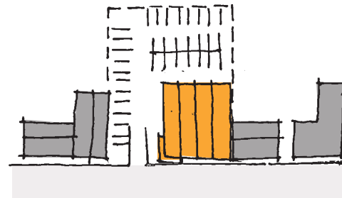
Good example of commercial parking arrangement