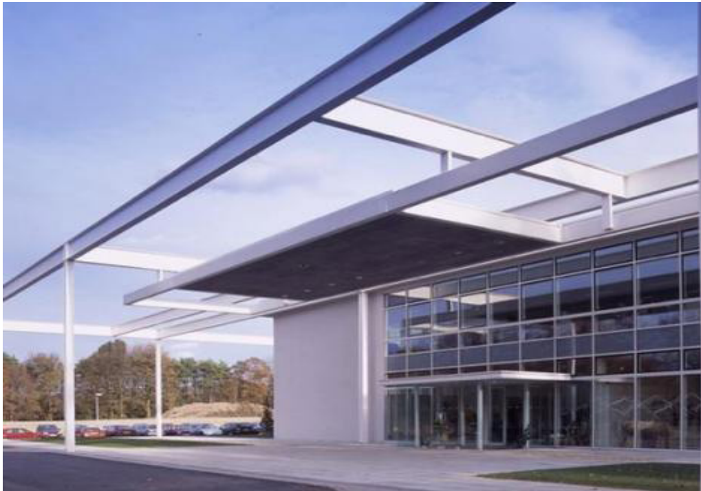
Entrance court of award-winning Ercol building in Princes Risborough