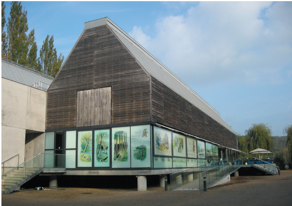
Rowing Museum, Henley (Oxfordshire)