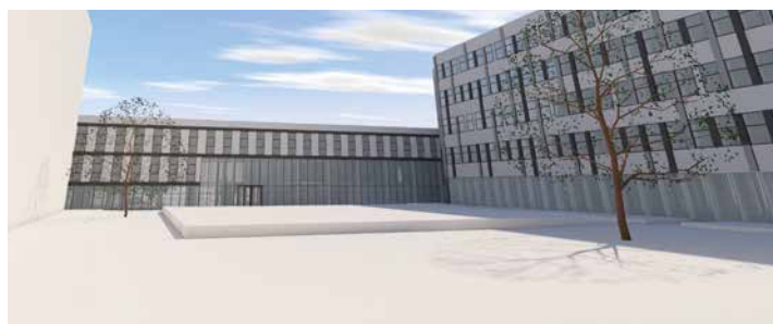
Potential view of courtyard without Main Lecture Theatre