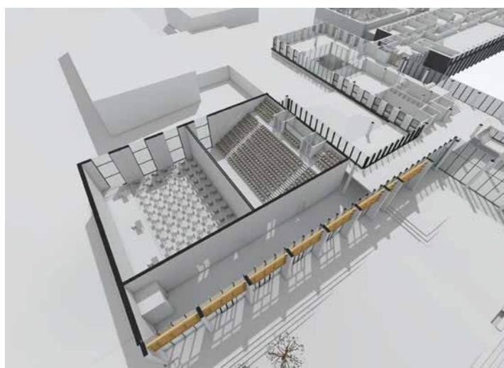
The hall could also be split in two with a lowered acoustic screen for using as two teaching spaces. This could provide a 250 seat lecture theatre, with separate space for further teaching

What do you think of the proposed Main Hall?