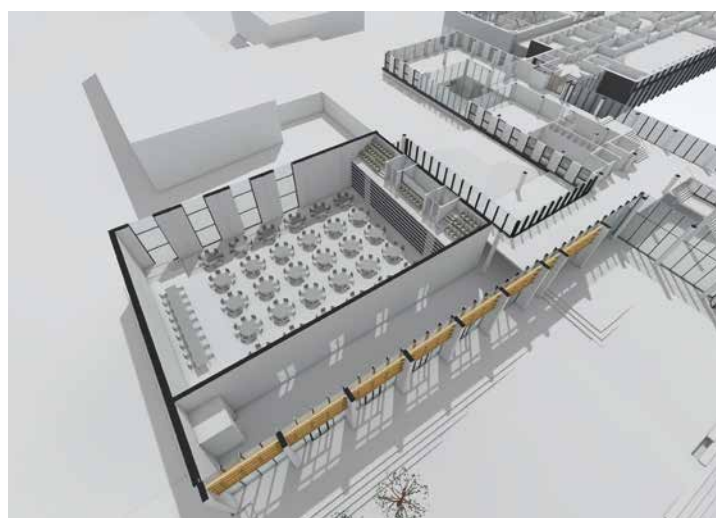
The hall could be used in its full size, for exams, events and graduations – with potential capacity for 750