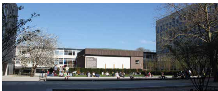
Current courtyard, including lecture theatre

This project is still under consideration by University leadership.